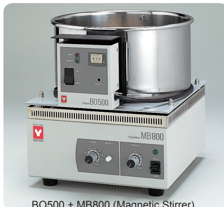
BO500 + MB800 (Magnetic Stirrer)